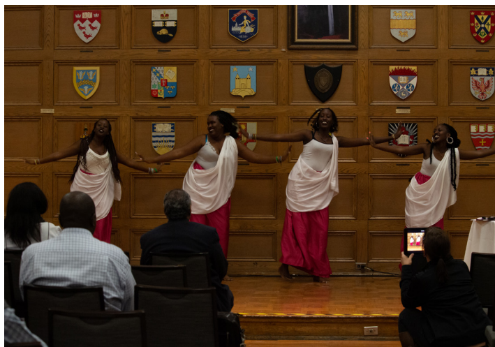
Club REMA, a Burundi dance group who performed some dances to end off our annual Africa-Western Collaboration Day!