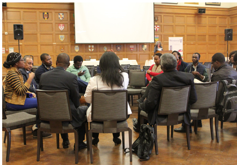
A photo from the informal mixer event prior to our Africa-Western Collaboration Day, where our graduate students were able to sit down and speak with our visitors and the Ambassador to Sudan.

Furthermore, it hopes to be a place for people to gather, make friends, and build their own support networks. Stay tuned for more AIGSC programming this semester!